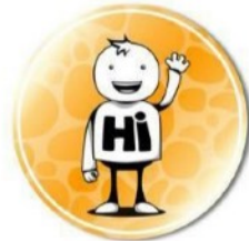
Kongenitaler Hyperinsulinismus e.V.