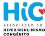
Associação do Hiperinsulinismo Congénito