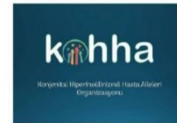
Konjenital Hiperinsülinizmli Hasta Alieleri Organizasyonu