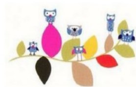
Association des Hyperinsulinismes